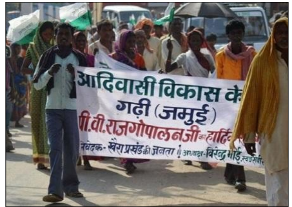
Rally in Jamui district, Bihar, April 20th, 2012

floods. Schemes for Maha Dalits, flood control or land development are supposed to help them, but as they are not implemented properly, the situation is not improving. From this region, 150 people will take part in the March Jan Satyagraha.