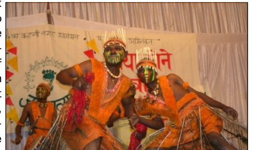
Dancers from Gujarat, Katni, April 17 th , 2012

Theatre festival. The same evening of the Maja Koene Awards ceremony, was the closing show of the theatre festival. Every year, groups of artists involved in the cultural branch of Ekta Parishad called Ekta Kala Manch, meet for a five days training. Coming from all over India, this is an occasion to discover and share different types of dances, songs and plays, and to work on all these forms of expressions which are strong ways to mobilize and encourage people in their non-violent struggle for justice. On the closing evening, in Katni, each group presented its creation: plays about villagers facing the issue of displacement, traditional Adivasis dances, songs about life in rural areas and people's struggle. Seeing them performing, it is good to know that they will come to the march in October, as their songs, plays, dances and slogans will be a great support for the marchers, and a powerful mean to raise the voice of poor and marginalized communities.