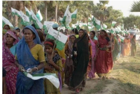
Rally in Patna, Bihar, April 25th, 2012

Migration. In the district of East Champaran, one of the issues is the large scale migration. 35 to 40% of the people here work as farmer's employees because they are landless. As they get employment only part of the year, they go to work part of the year on the hills of Jammu and Kashmir. To counter the problem, some governmental schemes exist, like the Minimum Employment Act which guarantees 100 days of work per person and per year, but they are not efficient as they are not properly implemented. The government records show only 7 days of employment given in 2010-2011. During the same period, more than 200 000 left the district.