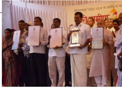
Laureates of Maja Koene Awards, Katni, April 17 th .

Kondotty Cultural Union (KCU) is an exceptionally committed organization adopting innovative social programs and activities to address injustice and poverty in society. KCU has successfully brought together many middle class young people, cutting across communal lines to join the struggles of the poor and deprived communities for a better life.