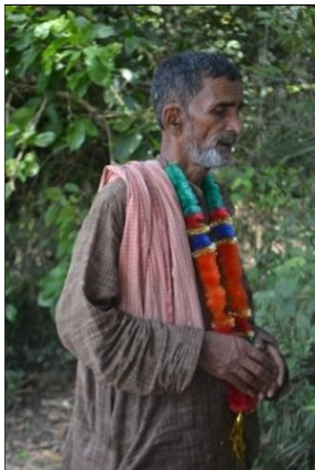
A man in Madhurani district, Bihar, April 14th, 2012

In Chatarpur, in Supaul district, 1700 ha of land was given during the Bhoodan movement, but until now this land has not been distributed and is still occupied by the previous owners. The area counts about 14000 homeless people; the administration is not taking any action to distribute the Bhoodan land. During its journey in Bihar, the Jan Samwad Yatra went in different places where the situation is the same: Bhoodan land is not in the hand of people, and people request the Jan Satyagraha to take their case to the central government.