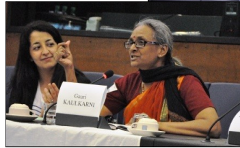
Karima Delli (European Deputy, Green Party) and Gauri Kulkarni (Ekta Parishad)