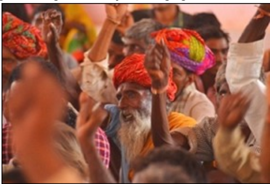
Public meeting, Rajasthan, July 7 th , 2012

The government is misleading the farmers. In the district of Chittaurgarh, the Indira Sagar dam was built to provide water to the farmers of the region. At the same time, the government passed an agreement with private companies to set up 29 industrial units. 14 villages have been displaced to make place for these industries. In compensation, people received 100 000 to 200 000 Rupees, but their land was sold between 2 to 4 million Rupees to the private companies. Farmers who were not displaced can't irrigate their land, as the dam is in fact supplying the industries. Those who dared to oppose this process have been charged with false cases framed by the government.