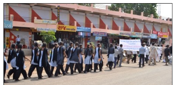
Students participating in a march of the Jan Samwad Yatra, Gujarat, June 17th, 2012

stop activists by assimilating them to violent groups. Because of the presence of social organizations struggling for the rights of people displaced by dams, sanctuaries and tourist spots, the government of Gujarat declared Dang as a violent prone region. Those who work for the displaced people are often branded as Naxalites (armed groups also called “Maoists”) and put behind the bars.