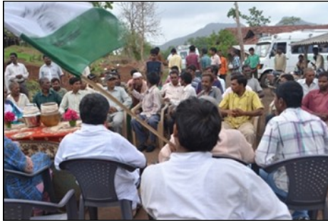
Meeting with the yatra, Gujarat, June 20 th , 2012

Promoting non-violence and Rights to land & livelihood | Mobilizing for the March Jan Satyagraha 2012 | October 2011 - September 2012